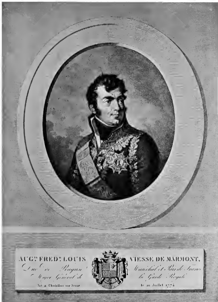
AUGUSTE DE MARMONT, DUKE OF RAGUSA FROM AN ENGRAVING AFTER THE PAINTING BY MUNERET